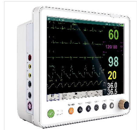
KH-PM12C 12' Color TFT Display