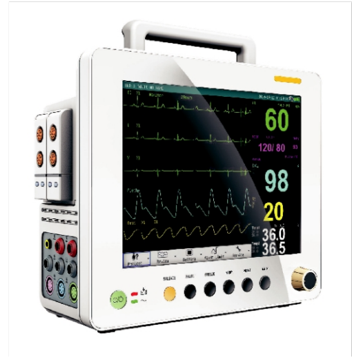
KH-PM12A 12.1' Modular