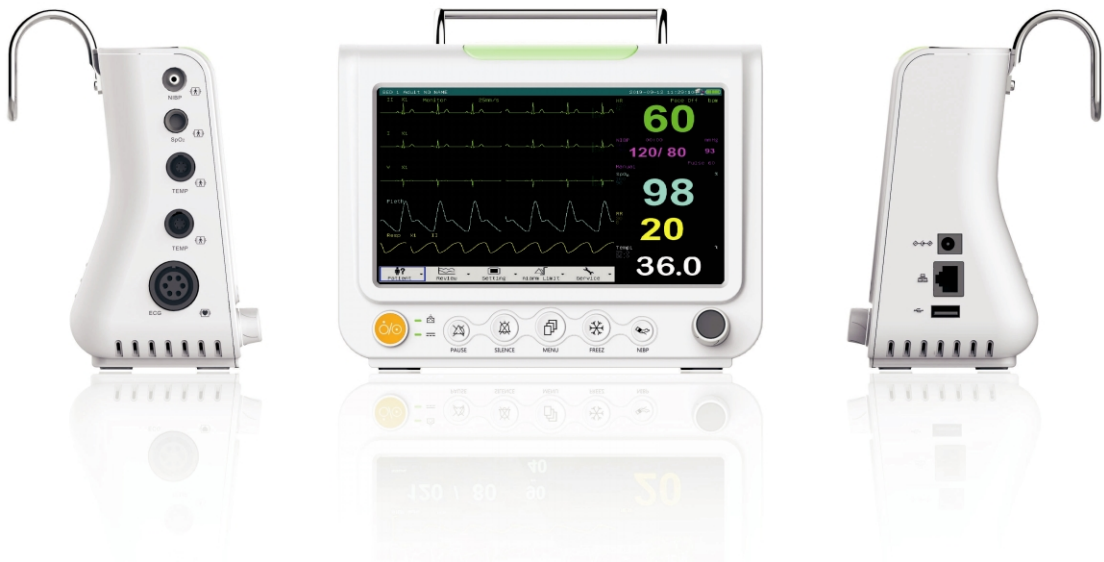
KH-PM07 7" Color TFT Display