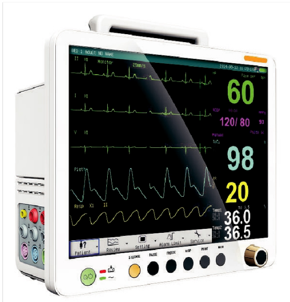
KH-PM15B 15" Color TFT Display