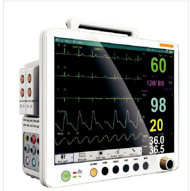
KH-PM15A 15" Color TFT Display