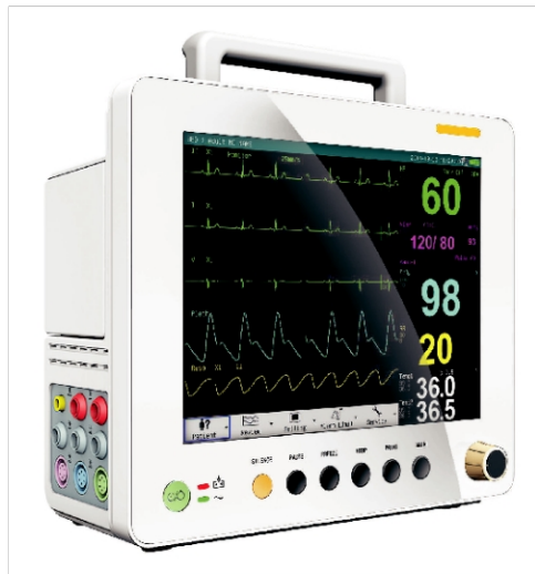
KH-PM12B 12.1' Color TFT Display