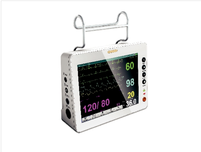
KH-PM08 8' Color TFT Display